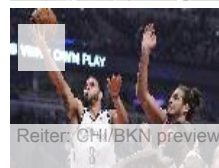
Reiter: CHI/BKN preview