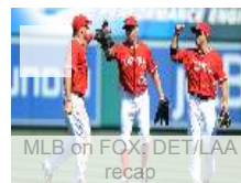
MLB on FOX: DET/LAA recap