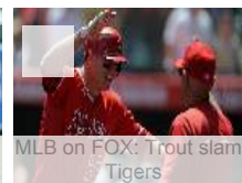
MLB on FOX: Trout slams Tigers