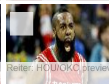
Reiter: HOU/OKC preview