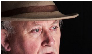
Billionaire Tells Americans to Prepare