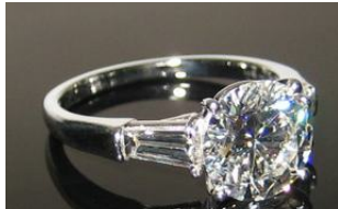
Should You Buy Previously Owned