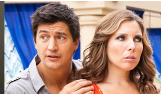
VIDEO: Conan O'Brien calls it "Hilarious!"