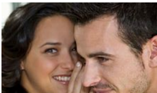
Top 10 Things Men Want From You